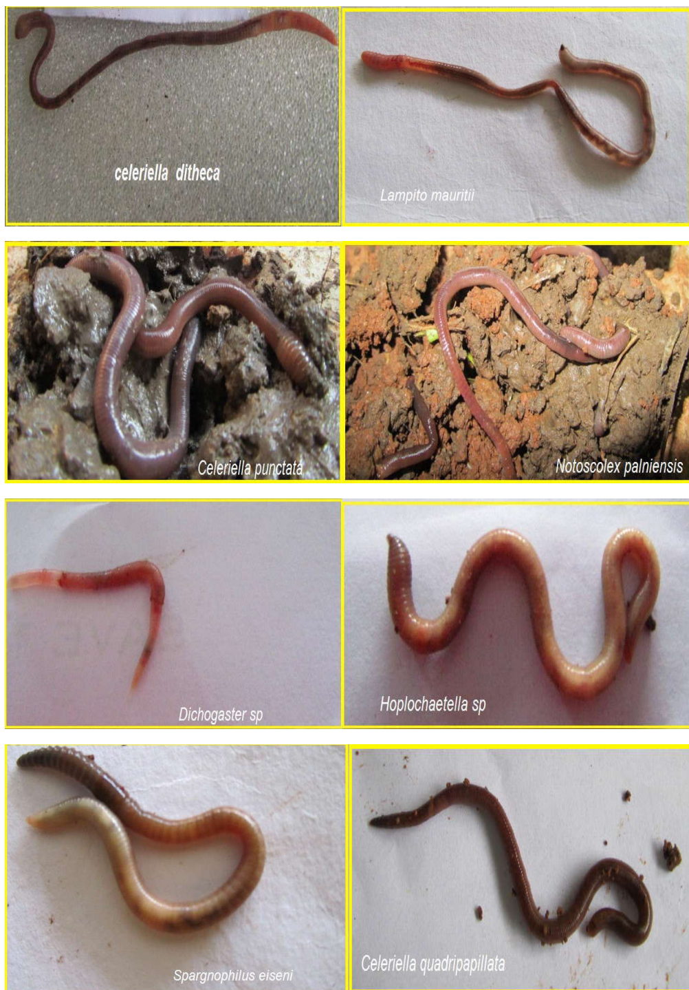
Figure 2. Identified earthworm species